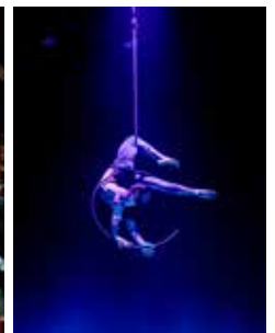
BRIEFS