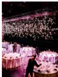
TRELISE COOPER, THEATRE OF FASHION