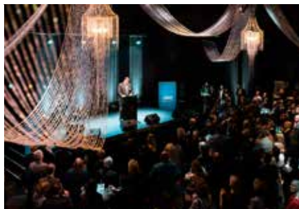
BARFOOT & THOMPSON CLIENT APPRECIATION EVENT