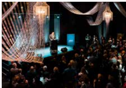
BARFOOT & THOMPSON CLIENT APPRECIATION EVENT