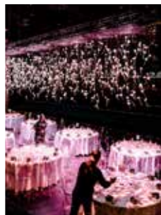
TRELISE COOPER, THEATRE OF FASHION