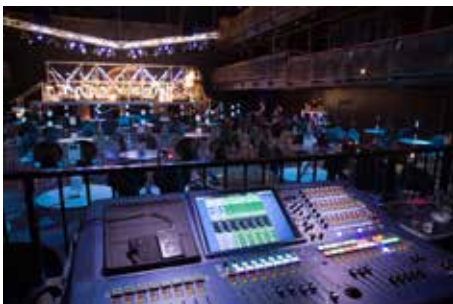
WELLINGTON UKULELE ORCHESTRA

With a comprehensive selection of technical equipment, and direct connections to New Zealand's best creatives, events at Q are more than just meetings and dinners. They're works of art.