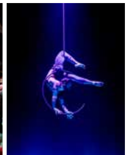
BRIEFS PHOTO CREDIT: ALEX HOYLES

For more information about Q, or to arrange a venue tour, contact: